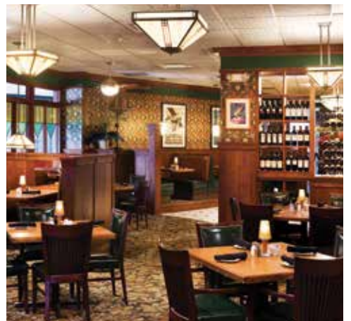
Best Western Ramkota Hotel • (605) 229-4040